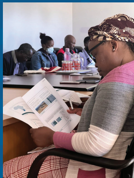
Project briefing session with councilors at Lehlakaneng Community Council in the Mafeteng District.

In preparation for the upcoming water conveyance system technical feasibility study and the Environ-