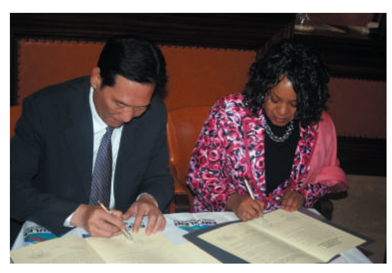
FORMAL TRADE BILATERAL : Quzhou and Emfuleni Municipalities

Emfuleni Local Municipality and Quzhou Municipality officially signed a ground-breaking co-operative partnership agreement. The event took place at the mayoral chamber in Vanderbijlpark on the 24 May 2012.